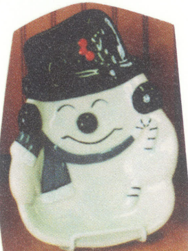
#330 Happy Snowman Cookie Plate 7.5" x 4.5"