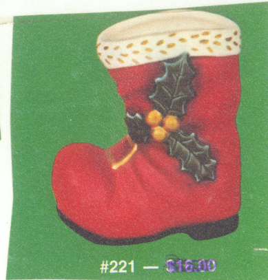
#221 — $16.00