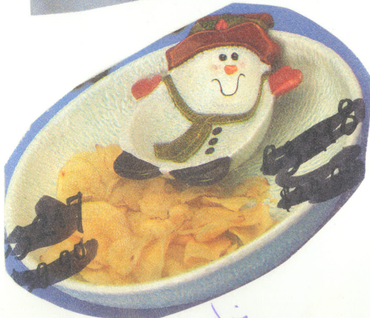
Snowman chip dip