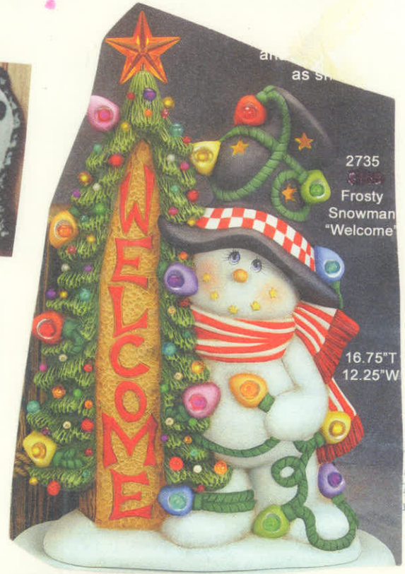
2735 Frosty Snowman "Welcome"