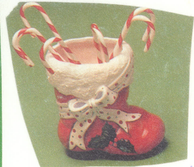
Med boot w/ Ribbon+holly Byron