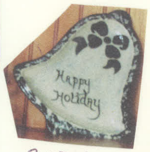
Bell Dish 7 1/2