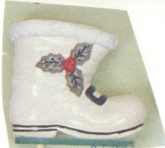
Med boot w/ holly McNee's # 360