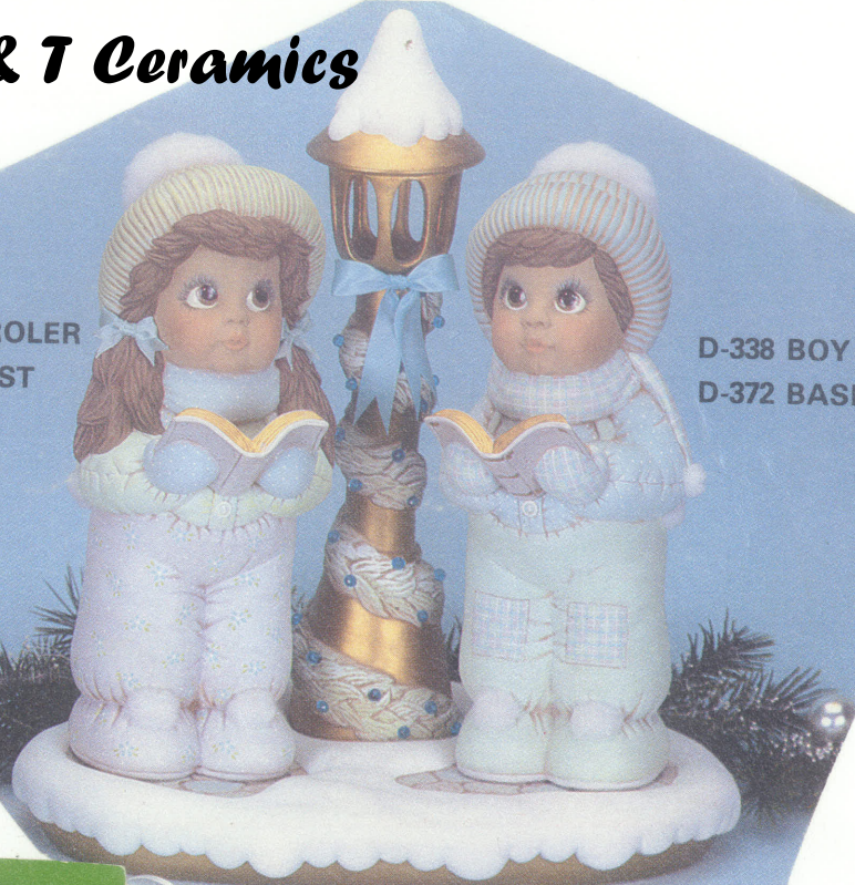
D-338 BOY CAROLER D-372 BASE